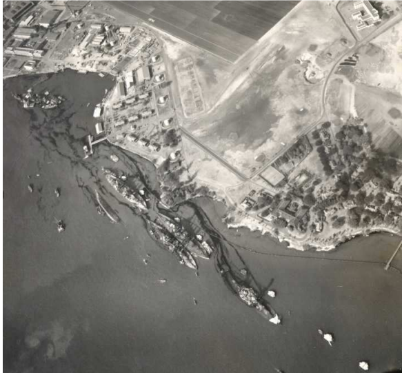
December 7, 1941- Pearl Harbor Remembrance There are other events that I did not have pictures for. Legion Riders first annual poker run. Flag raising at the Belgrade Intermediate School. Flag Retirement Ceremony on Flag Day Fall Festival