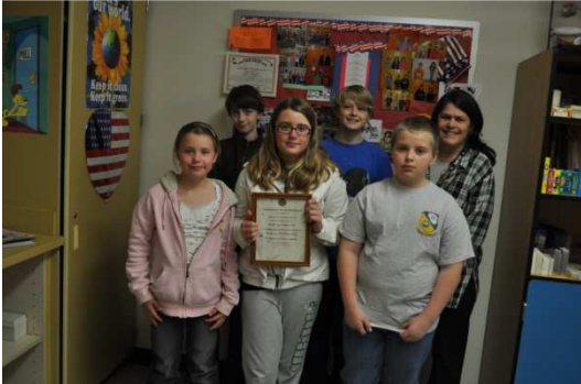
Belgrade Intermediate School Military Family Support Group

The following is pictures remembering the events that went on with us and other Legion members this past year.