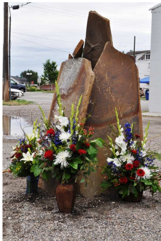
Dedication of the Japanese- American Veteran Memorial