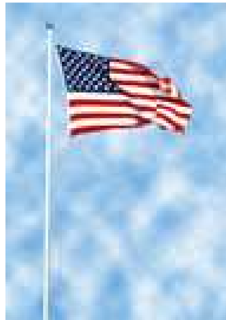
"America.. the beautiful."