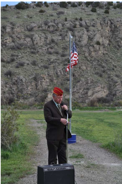
Dedication of the Logon Veterans Fishing Park