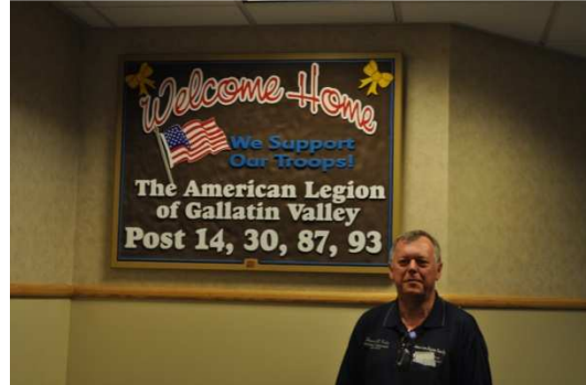
National Commander Jimmie Foster isit