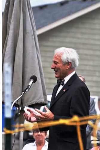
LT Governor Bolinger -USMC