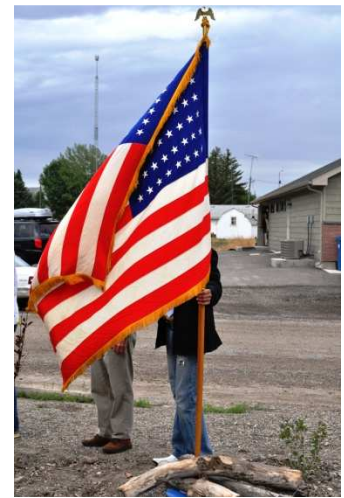
Three Forks Post 93 supplied the US flag.