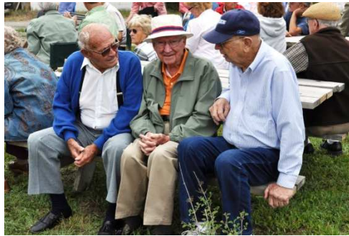
War stories were sure flying at this table.